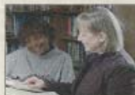
Adult students, teachers learn together