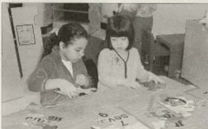
PUTTING THE PIECES TOGETHER: Preschool students work hand-in-hand to help one another solve a large-than-life size puzzle.