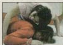
High school students learn basics of CPR