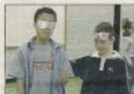
Northern students learn about extraordinary people