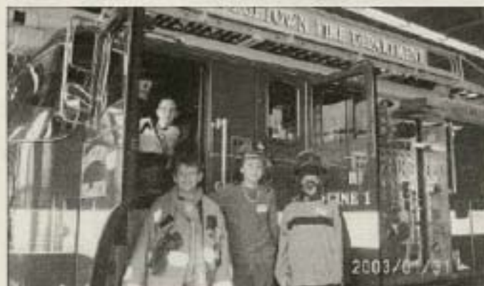
ME AND MY SHADOW: Eastern Elementary students had the opportunity to learn about careers from the Georgetown Fire Department in honor of Geozoid Hog Job Shadow Day.