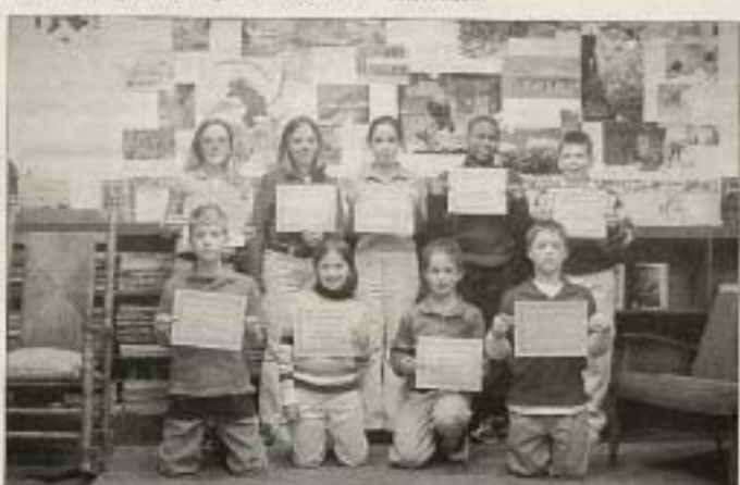
HELPING OTHERS: Sixth grade peer mediators help fellow students improve communication.